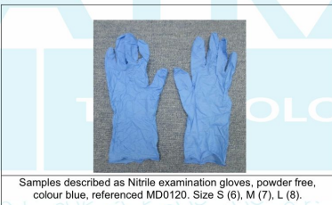
Samples described as Nitrile examination gloves, powder free, colour blue, referenced MD0120. Size S (6), M (7), L (8).